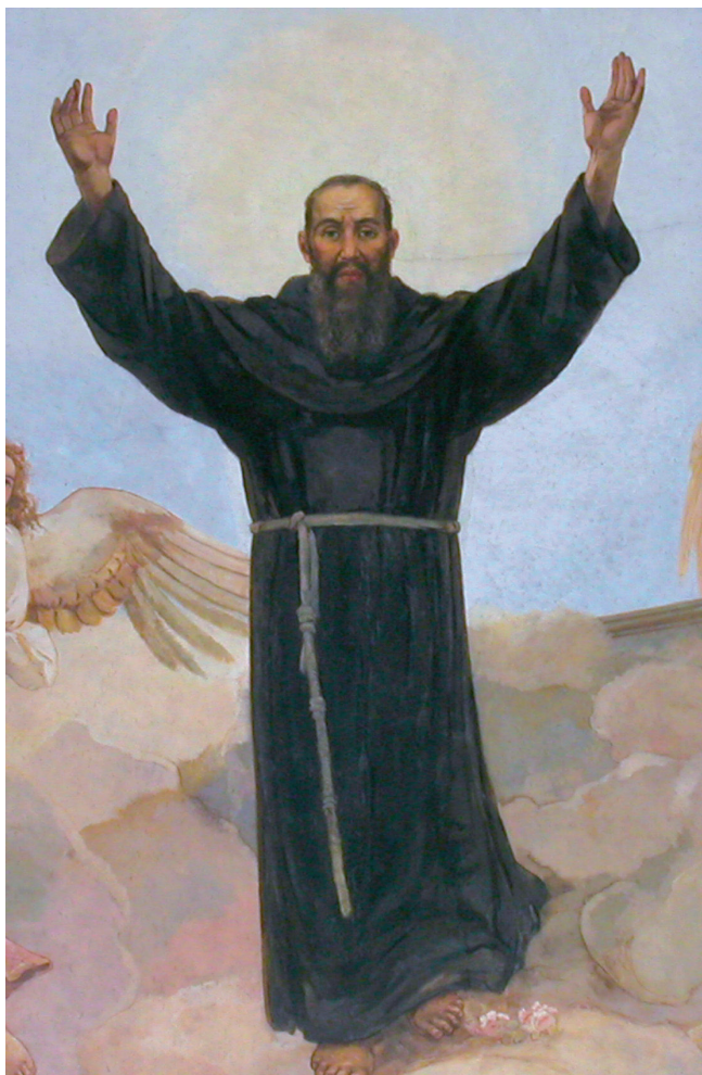
Osimo - The main altar